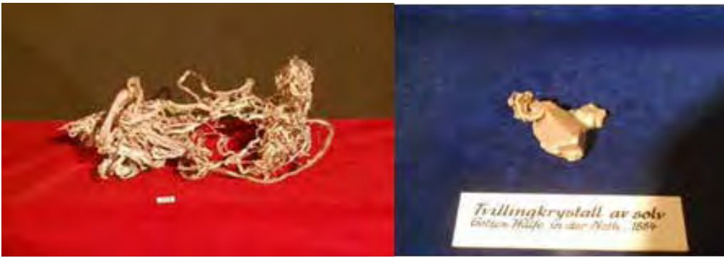
The famous Kongsberg Silver from "The Vault" at the Norsk Bergverksmuseum.

shales of the Oslo region, which have been calculated to contain more than enough silver to account for the Kongsberg deposits (Frøyland and Segalstad, 1992; Segalstad, 1996; Segalstad and Raade, 2003). The ore formed about 3 to 4 km deep from fluids 200 to 300° C with salinities as high as 35% NaCl equivalent (Segalstad, 1985, 2000; Larsen et al., 2005). The bedrock of the Kongsberg area includes sulphide-rich zones locally known as fahlbands (Gammon, 1966). When the hydrothermal fluids encountered the fahlbands, they chemically reacted and formed the famous silver deposits (Segalstad, 2001). Minerals found in the hydrothermal veins include quartz, pyrite, calcite, baryte, fluorite, galena, sphalerite, chalcopyrite, silver sulphosalts, argentite, native silver, and pyrrhotite. "Coalblende," a bitumen compound likely derived from the Oslo Rift shales, is also found in the veins (Neumann, 1944; Johnsen, 1986, 1987; Bancroft et al., 2001; Segalstad and Raade, 2003).