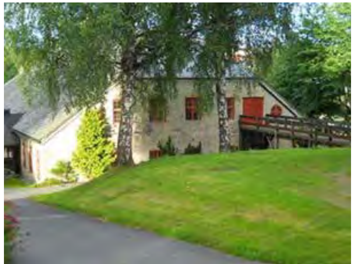
The Norsk Bergverksmuseum (Norwegian Mining Museum) in Kongsberg, Norway.

For much of the Kongsberg Mining District's history, it was the largest mining operation in Norway (Moen, 1967; Berg, 1998; Helleberg, 2000). As early as the 1600s, the mines offered workers desirable benefits such as sick pay, free medical care, pensions, and primary and secondary schools for children. In 1757, the Norwegian Mining Academy was established in Kongsberg to train mining engineers (Nordrum and Berg, 2004; Nordrum, 2008). The high point of mining in the district occurred in 1770, when 78 mines employed about 4000 workers (Nordrum, 2008). By 1805, however, much of the