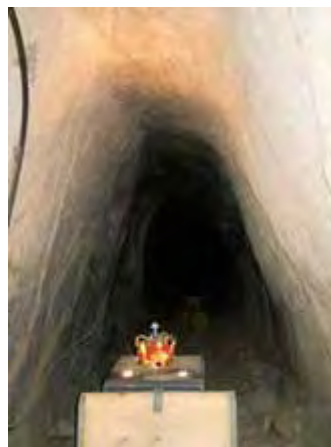
An example of a fireset drift in the Kongens Gruve (King's Mine).

~1.5–1.6 Ga and the second at 1.1–1.2 Ga (Jacobsen and Heier, 1978). The history of these rocks can be summarized into four basic stages. The oldest rocks began as volcanics with geochemistry similar to island arcs as well as some sediments. These rocks were intruded by gabbros and diorites followed shortly thereafter by the first event of deformation metamorphism. This amphibolite to granulite facies metamorphic event resulted in quartzo-feldspathic gneisses, dioritic gneisses, and amphibolites. Gabbro and dolerite later intruded the rocks. Lastly, the Meheia and Helgevannet granites were emplaced penecontemporaneous to the second event of deformation and metamorphism to amphibolite facies at 1.1-1.2 Ga (Jacobsen, 1975; Jacobsen and Heier, 1978). Ultimately, these events created bedrock consisting of quartz-plagioclase-biotite gneiss, mica and chlorite schist, amphibolite, and granite gneiss (Bugge, 1917; Starmer, 1985).