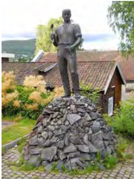
One of the many statues in Kongsberg, Norway commemorating its mining heritage.

In the summer of 1623, the children of two farmers were tending livestock in rural Norway when they found some rocks that caught their interest. They took the rocks home and showed their parents. One of the fathers recognized these rocks as silver, smelted them, and tried to sell the metal in nearby villages.