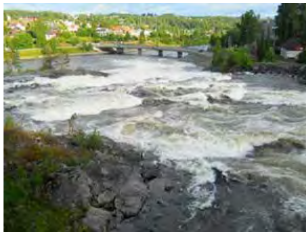
Looking down the River Lågen, Kongsberg, Norway.

The oldest bedrock in the Kongsberg area is ~1.6 Ga. Two events of deformation and metamorphism affected the area—the first at