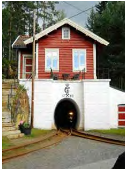
The Christian VII adit. Guided tours enter the King's Mine from here.